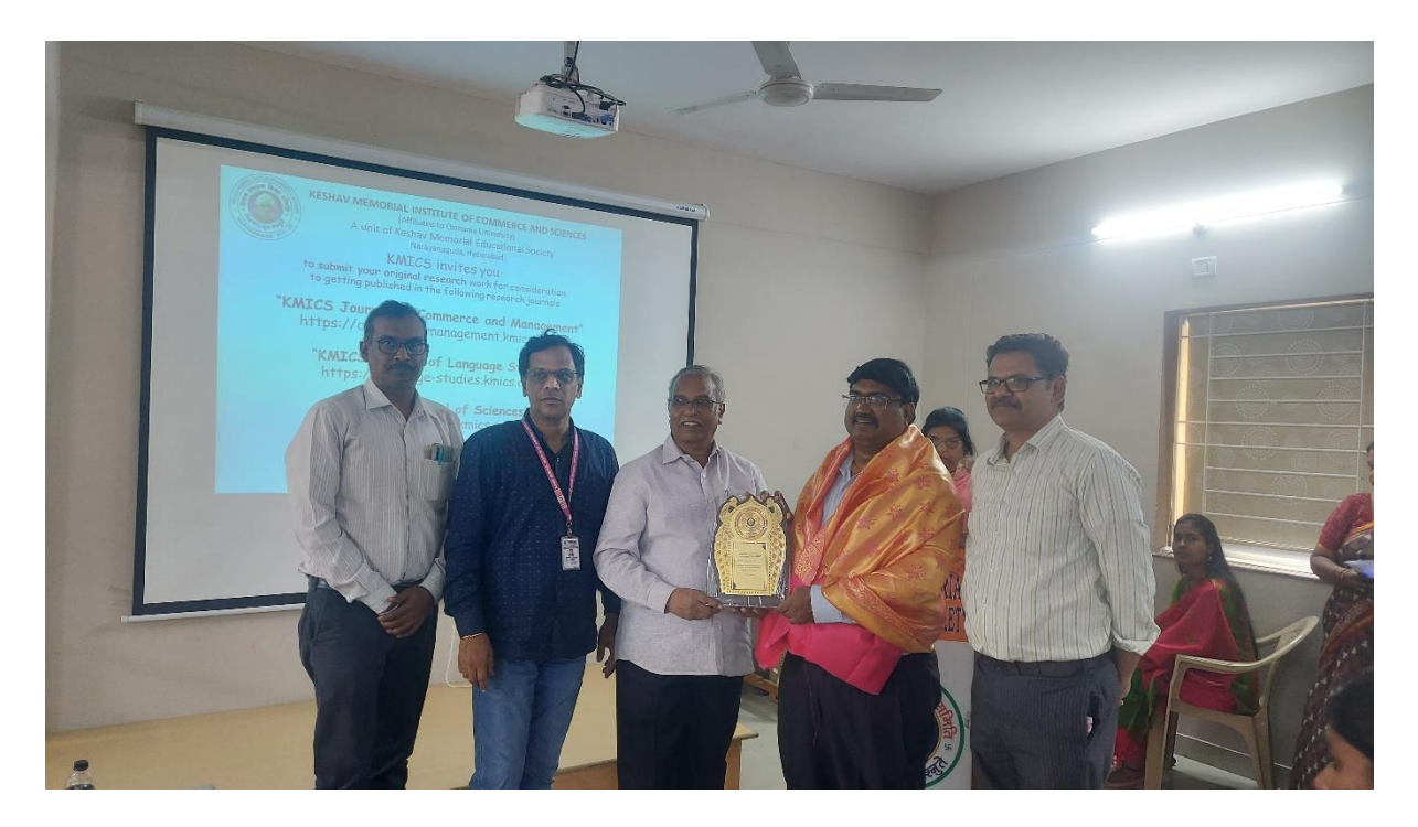
Felicitation Resource Person Day 4